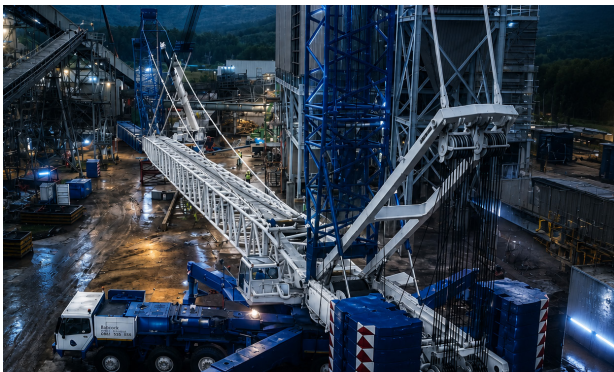
Plant and Lifting Solutions

Four specialised capabilities. One trusted partner.