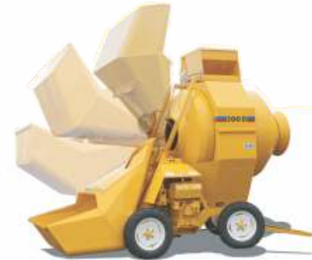
hopper raises hydraulically for drum charging