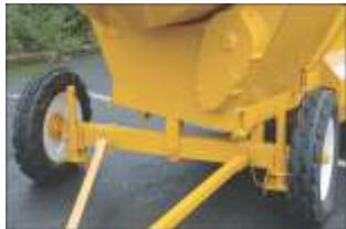
jack-legs are lowered during mixing for stability, swivelling front axle aids site manouevrability