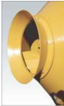
discharge cone (standard fitting)