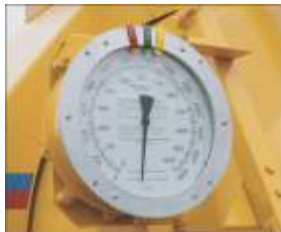
mechanical batchweigher accurate to +/- 3% (optional extra)