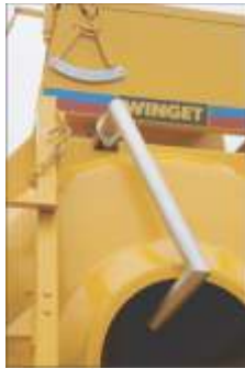
water feed pipe and water tank with calibrated pointer for measured discharge