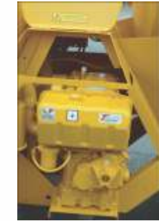
Lister Petter air cooled diesel engine(or 3 phase 415volt electric motor)