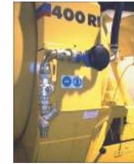
flowmeter available as no cost option instead of water tank