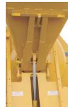
powerful hydraulic feed hopper

Heavy duty, reversing drum, mechanically fed concrete mixers offer reliability and simplicity for a long, productive life